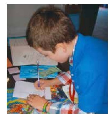
Students learn how to write a proper check.