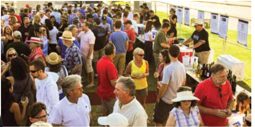
The beer garden was the place to be for many. ▲